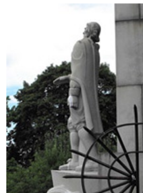
Providence RI, Prospect Terrace Park, R. Williams grave site & Throckmorton homestead