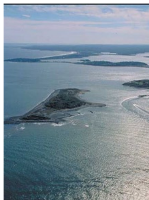
Nantasket Point (top), Nantasket Roads shipping channel (center left to right), & Boston Harbor Islands