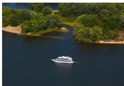
Narragansett Bay cruise past Prudence Island & Newport