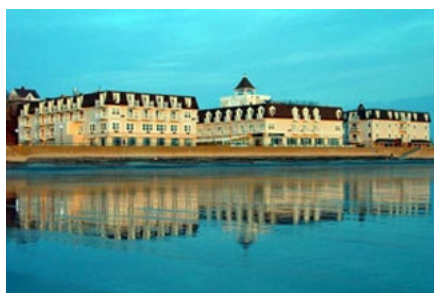
Reunion Base: the Clarion Nantasket Beach Resort and Spa