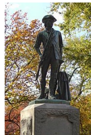
Concord MA "By the rude bridge...the embattled farmers stood"